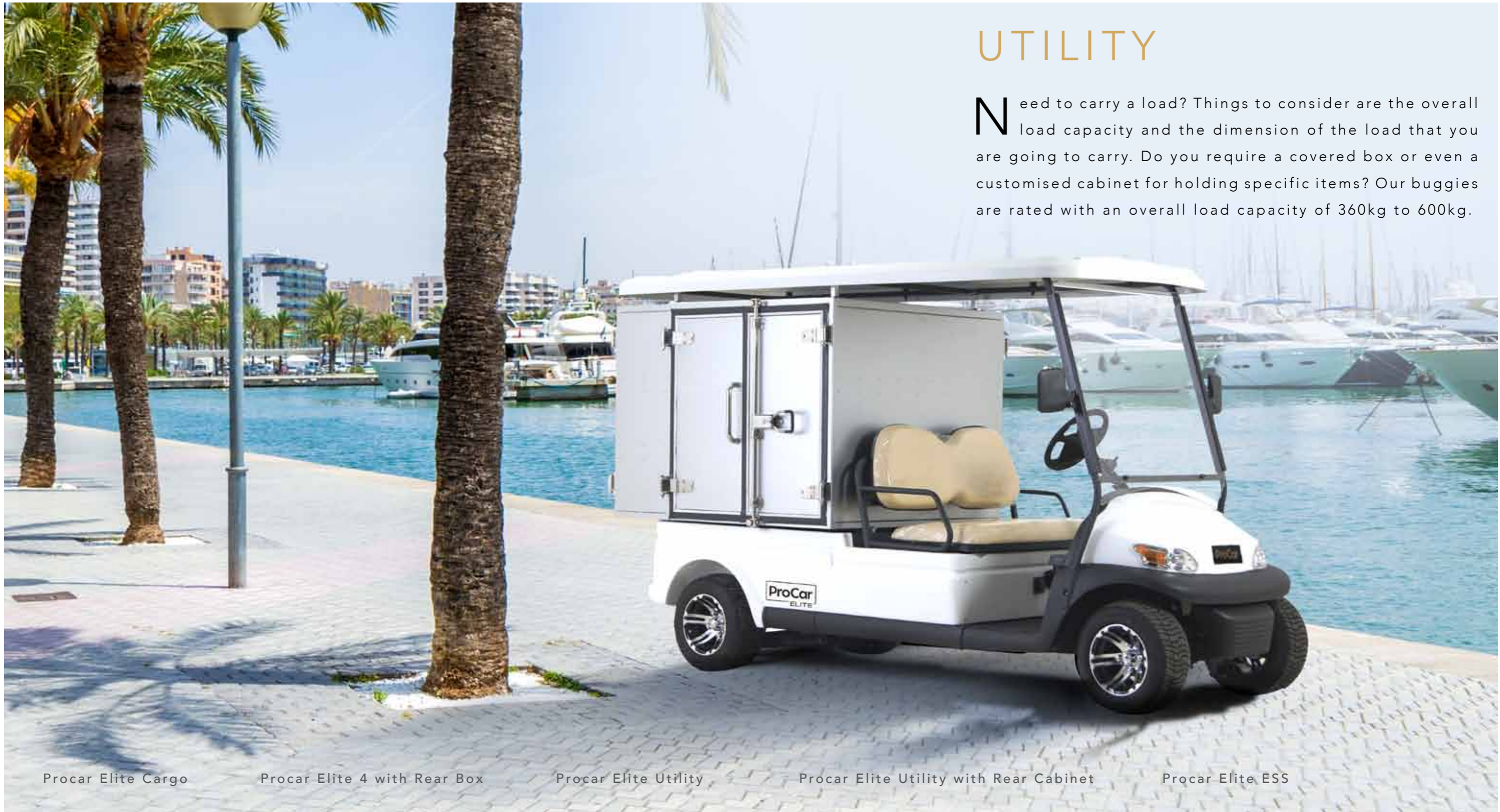
Procar Elite Cargo

Need to carry a load? Things to consider are the overall load capacity and the dimension of the load that you are going to carry. Do you require a covered box or even a customised cabinet for holding specific items? Our buggies are rated with an overall load capacity of 360kg to 600kg.